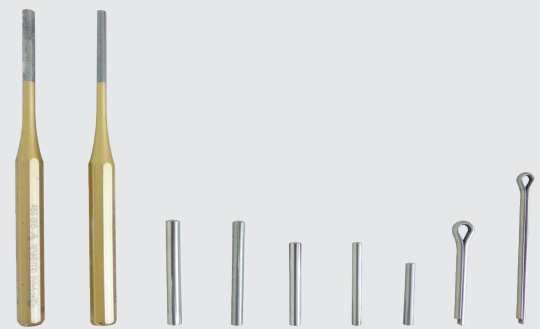
Pin punches, grooved pins, cotter pins