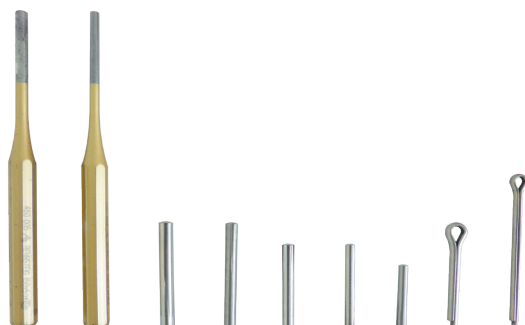
Pin punches, grooved pins, cotter pins