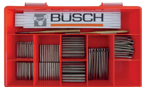
Assortment box with complete equipment