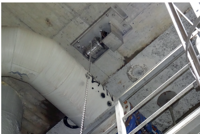
Application example for dowelling under the ceiling.