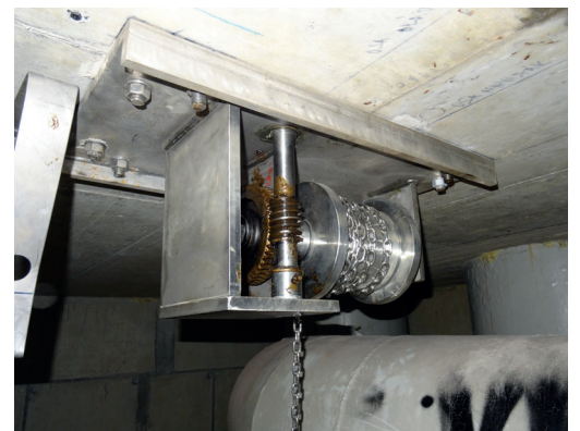
Application example for dowelling under the ceiling.