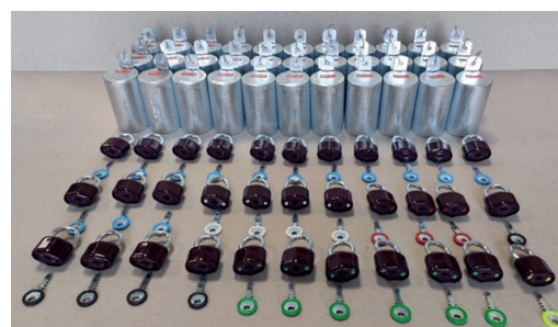
Locking plan can be created individually by different key colors of the padlocks.