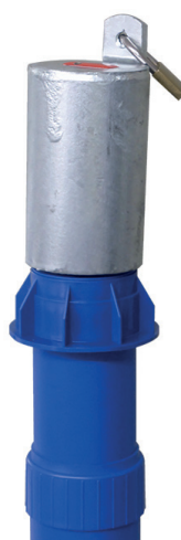
Lock system for square cap mounted on an extension