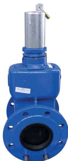
Lock system for square cap mounted on a valve