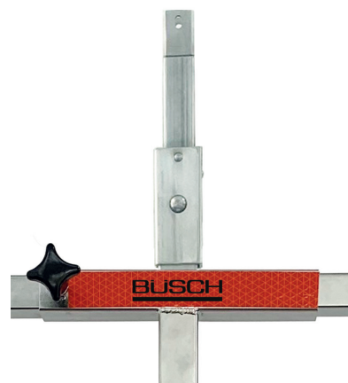
All-in-one operating key with attached coupling sleeve for house connection