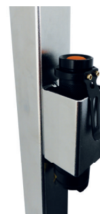
Integrated holder with torch