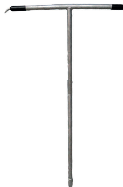
Standard operating key with square coupling sleeve 27