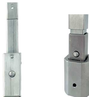
Detailed view (from left) attached coupling sleeves made of stainless steel for house connection and penstock