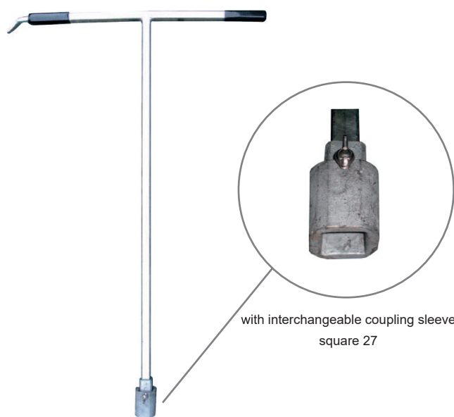
KOMBI operating key with square coupling sleeve 14 and 27

with interchangeable coupling sleeve square 27