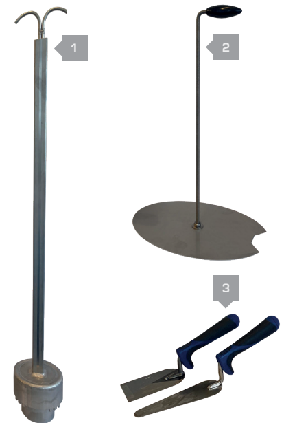
Claw cleaning rod (1), dirt trap (2), cleaning trowels (3)