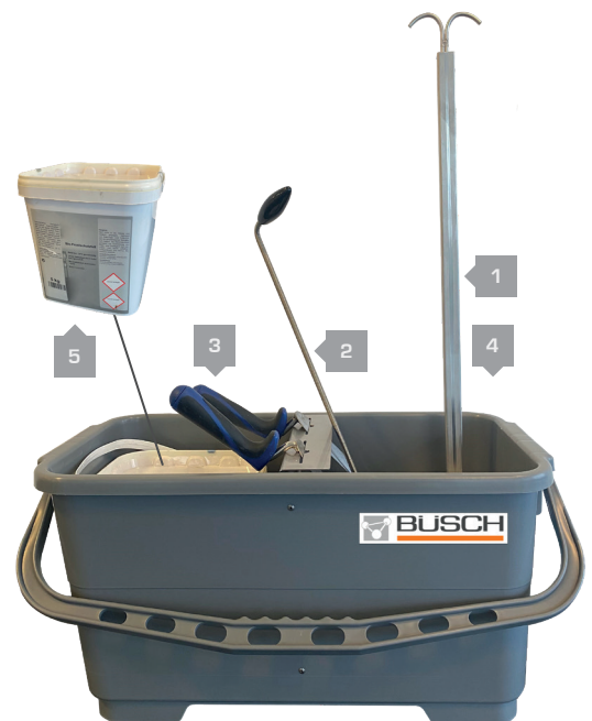
Underground hydrant cleaning set

Claw cleaning rod in combination with BÜSCH street cap cleaner for an optimal cleaning result of the entire street cap