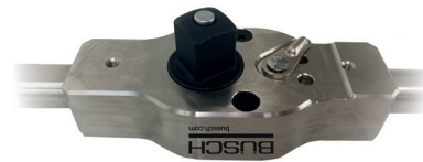
View from below: Direction changer as a simple changeover lever