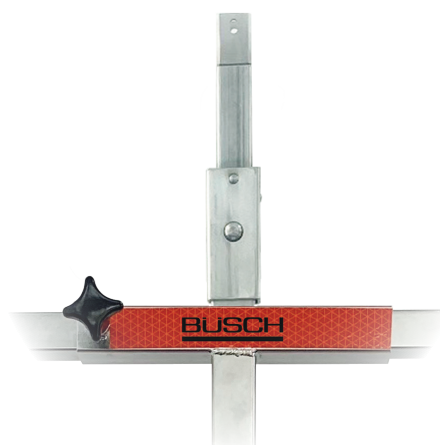
Operating key All-in-one with attached coupling sleeve square 12 mm for house connection