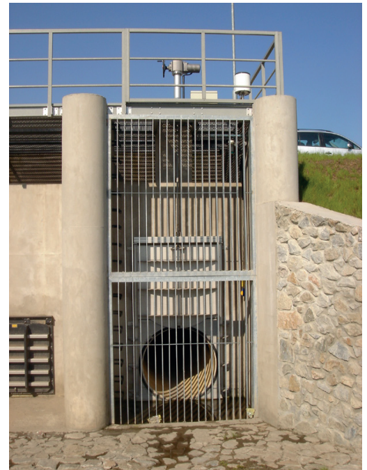
Bar screen 1800 x 4400 mm in front of a leakage penstock