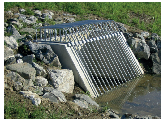
Curved bar screen on inlet edge

Dimensions as required: width (B), height (H), distance between bars horizontally (B1) and vertically (H1), frame designs (according to the conditions of the building): flat material, angle profile, rectangular profile Types of installation: dowelling or setting in concrete