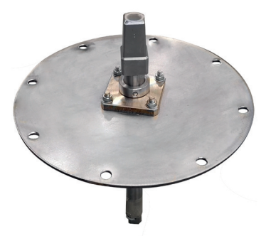
Waterproof bearing plate