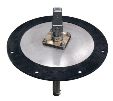
Waterproof bearing plate with NBR sealing