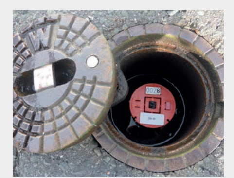
Easy assignment to house connection