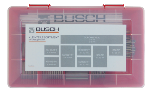
Assortment box closed with sticker for easy size assignmen

Refill packs of 30 pieces per variety available.