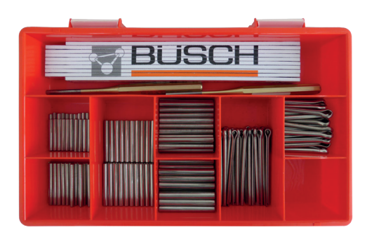
Assortment box with complete equipment