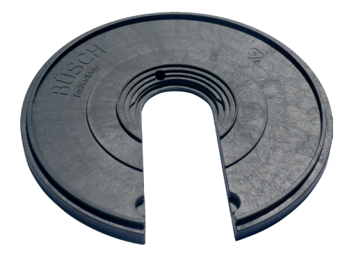
Support plate with notches for street caps size 1 and size 2