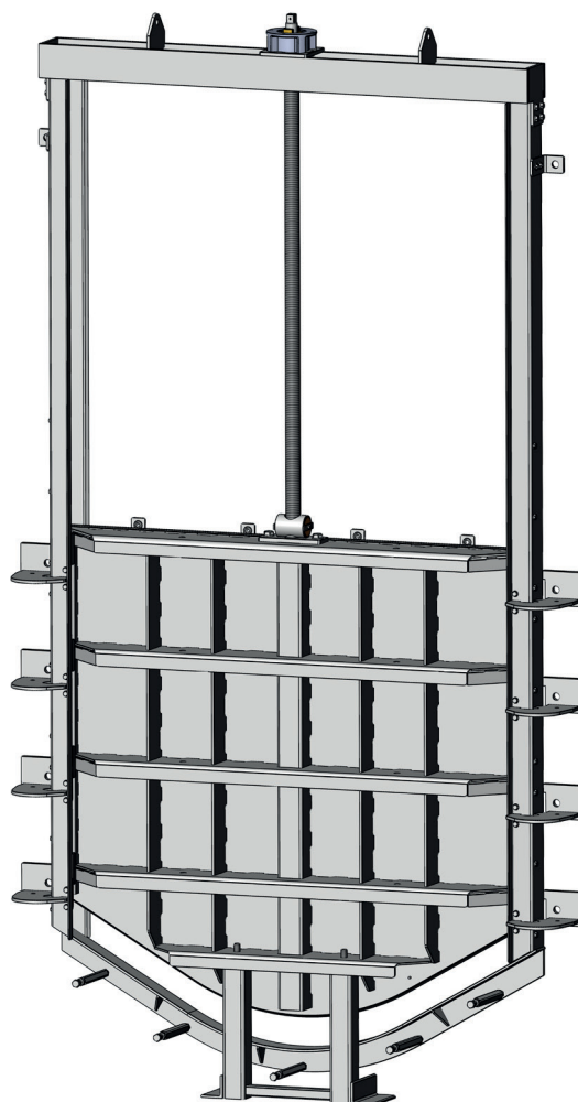
XL4 semicircular DN 1600 with preassembled installation aid