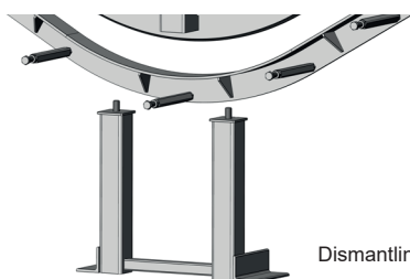
Dismantling the installation aid after the building process